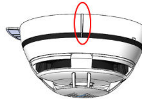
FIGURE 2: ALIGNMENT MARKS

Smoke detectors are not to be used with detector guards unless the combination has been evaluated and found suitable for that purpose.