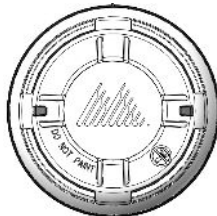
FIGURE 1: DETECTOR FRONT

Note: If the detector is used with the remote indicator, then the voltage value of the detector must be at least 18V as the indicators do not operate below 18V.