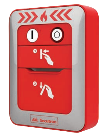
MRM-802MP 2 Stage