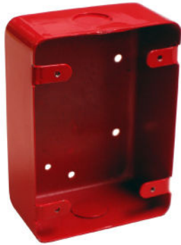
MRM-700 Surface Mount Backbox