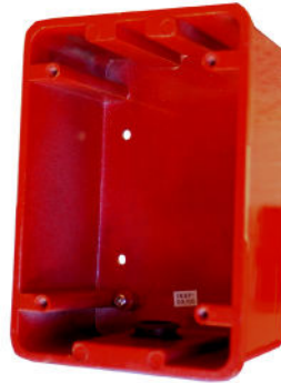
MRM-700WP Weatherproof Surface Mount Backbox