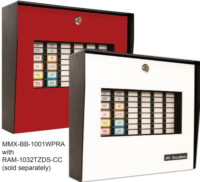
MMX-BB-1001WPRA with RAM-1032TZDS-CC (sold separately)