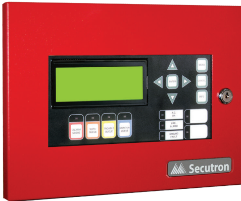
RAXN-LCD mounted in an MMX-BB-1001DR enclosure