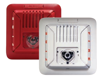
Ceiling Mount Horns/Strobes