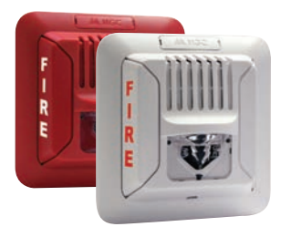
Wall Mount Horn/Strobes