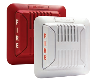
Wall/Ceiling Mount Horns