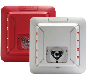
Ceiling Mount Strobes